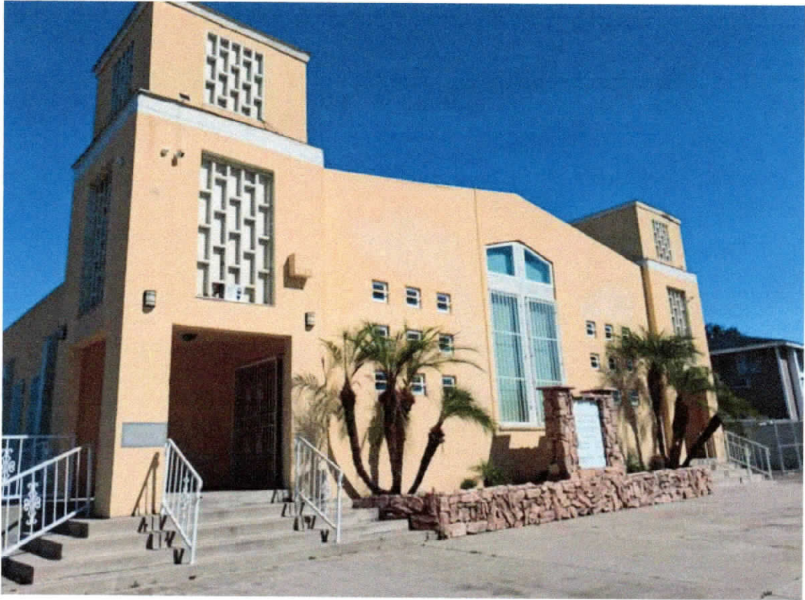
Facade, Looking Northeast 2 March 2026