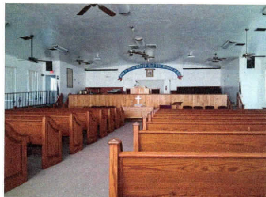
Interior 2 March 2026