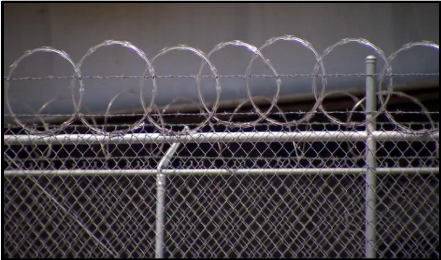
Example of razor wire security fencing